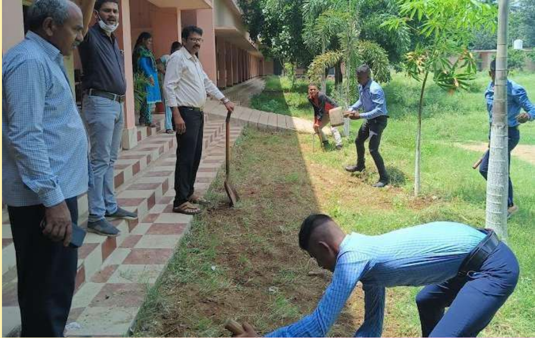
NSS UNIT I & II